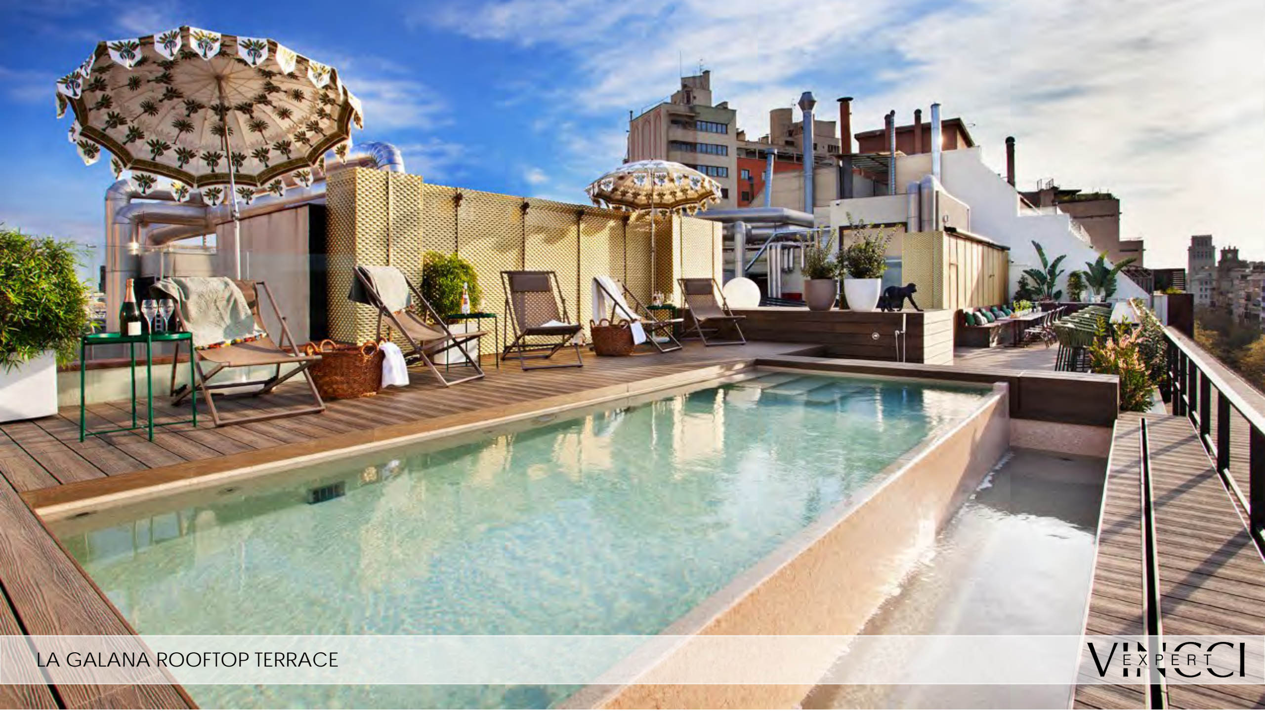
LA GALANA ROOFTOP TERRACE