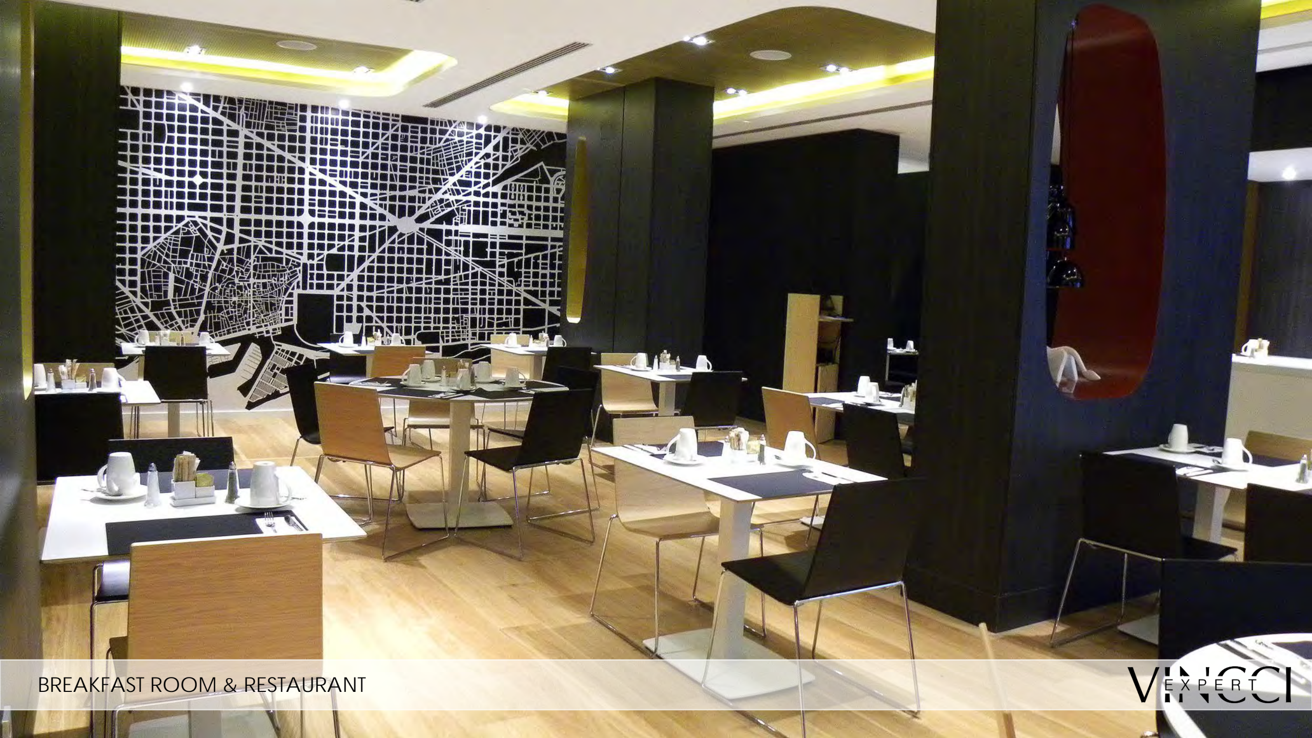
BREAKFAST ROOM & RESTAURANT