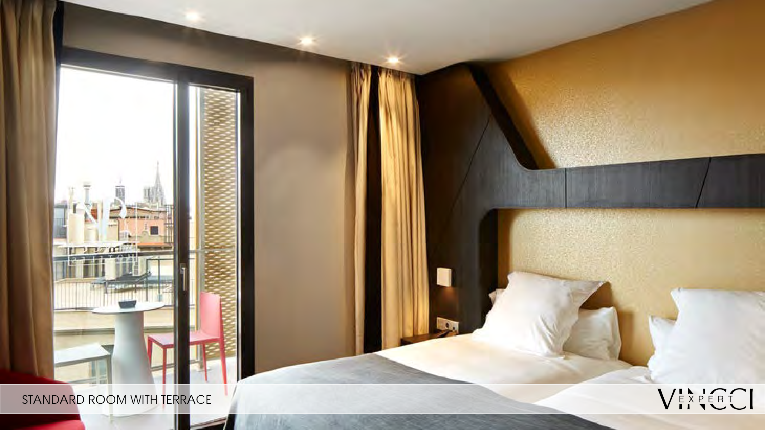
STANDARD ROOM WITH TERRACE